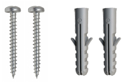
Wall Screws and Plugs Supplied

Measure distance apart for screws on the wall