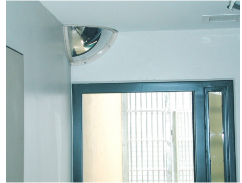
▶ Cell Observation