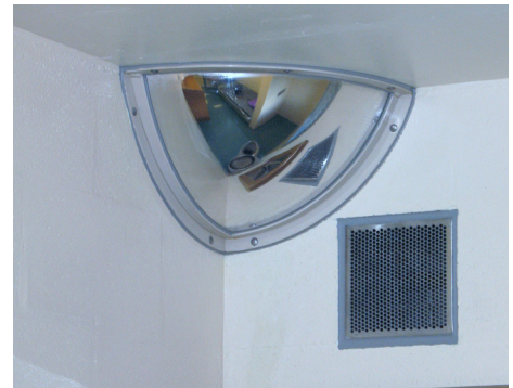
▶ Safely View Hard to See Areas