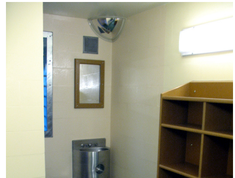
▶ View Safely Before Entering the Cell