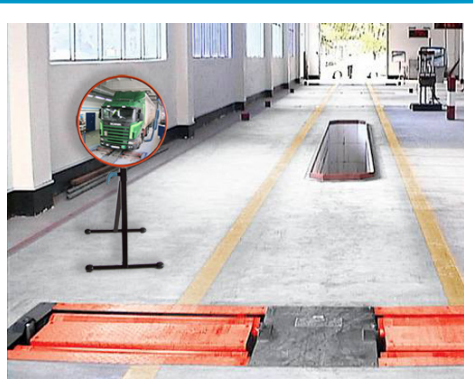
Vehicle Testing Station