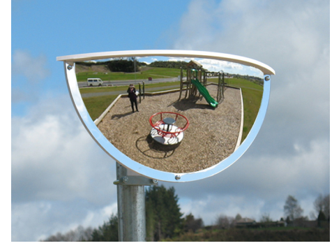
Playground and Childcare Observation