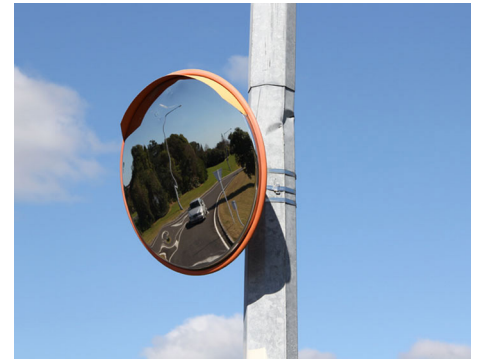
▶ Vandal Prone Areas