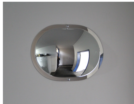
▶ Compact design in small spaces