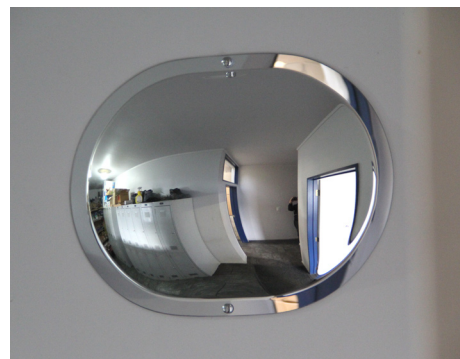
▶ Wide area view in corridors