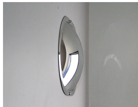
▶ Mount flat to the wall