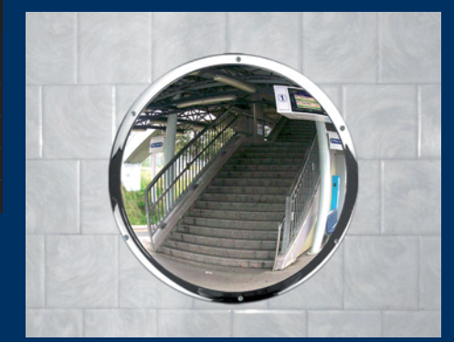
Subways and Stations