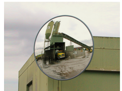
▶ Industrial Safety