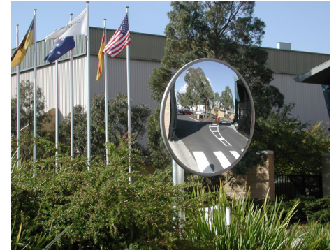
▶ Pedestrian Crossings