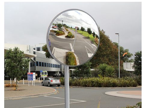
▶ Public Buildings and Carparks