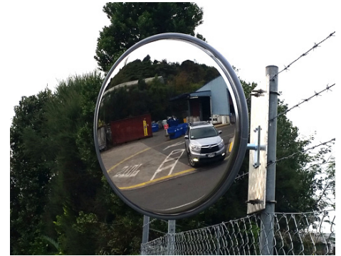
▶ Building Security