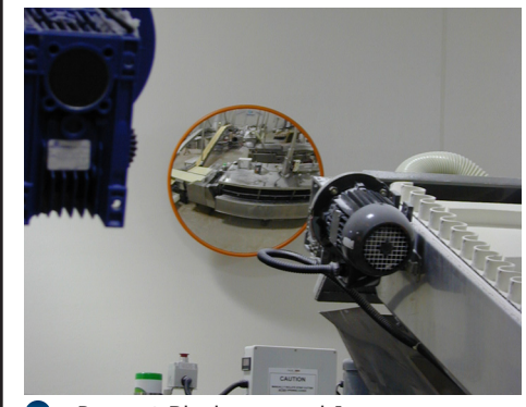
Prevent Blockages and Jams