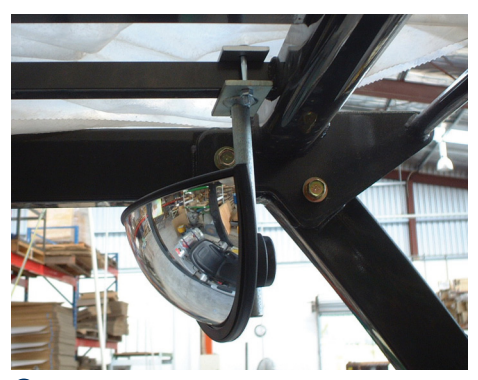
> 180° Viewing Area