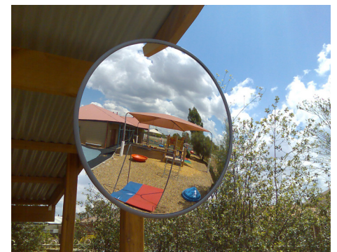
▶ Playground Observation