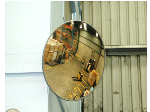
▶ Light Industrial Safety