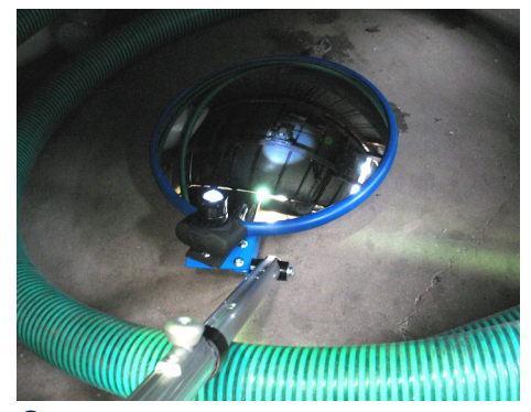
Base Light Available