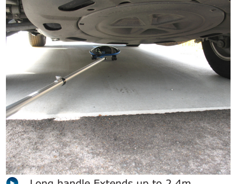
Long handle Extends up to 2.4m